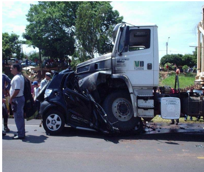
Crash scene – driver distracted by cell phone